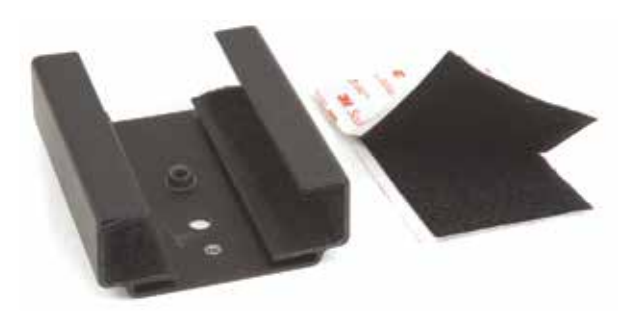
Other mounting options are available using the SRHARDWARE KIT.

This sleeve is supplied with Velcro swatches for mounting the SR Dual Receiver on a flat surface of camera, cart, rack, etc. The sleeve is sized and lined for a snug fit in a vertical or horizontal position.