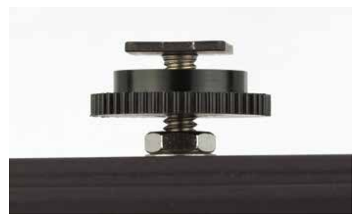
1.The insert nut in the sleeve and right angle bracket is an elliptical tensioning type.

The sleeve can also be mounted directly onto the tripod socket on the camera.