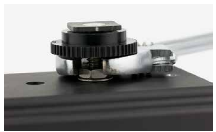
The threads will not bottom out.