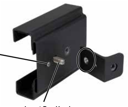
Insert Pan Head part # 28873

To attach the right angle bracket, first insert and tighten the retaining pin (3/32 allen wrench provided) which keeps the bracket from rotating.