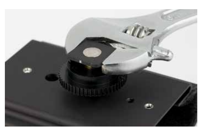
2. Use a wrench to thread the stud in about 1 - 2 turns, then rotate it to orient the receiver control panel in the desired direction.