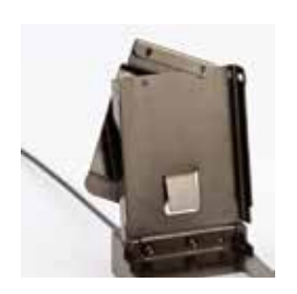
Align the openings and tabs precisely.

When mounting the belt clip onto the battery door, carefully align the openings with the retaining tabs on the door and press it into place. If the holes and tabs are not precisely aligned, the door may not close and latch properly.