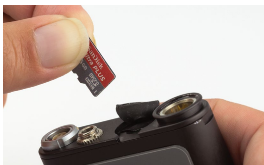
The audio is recorded on a micro SD card (HC type).