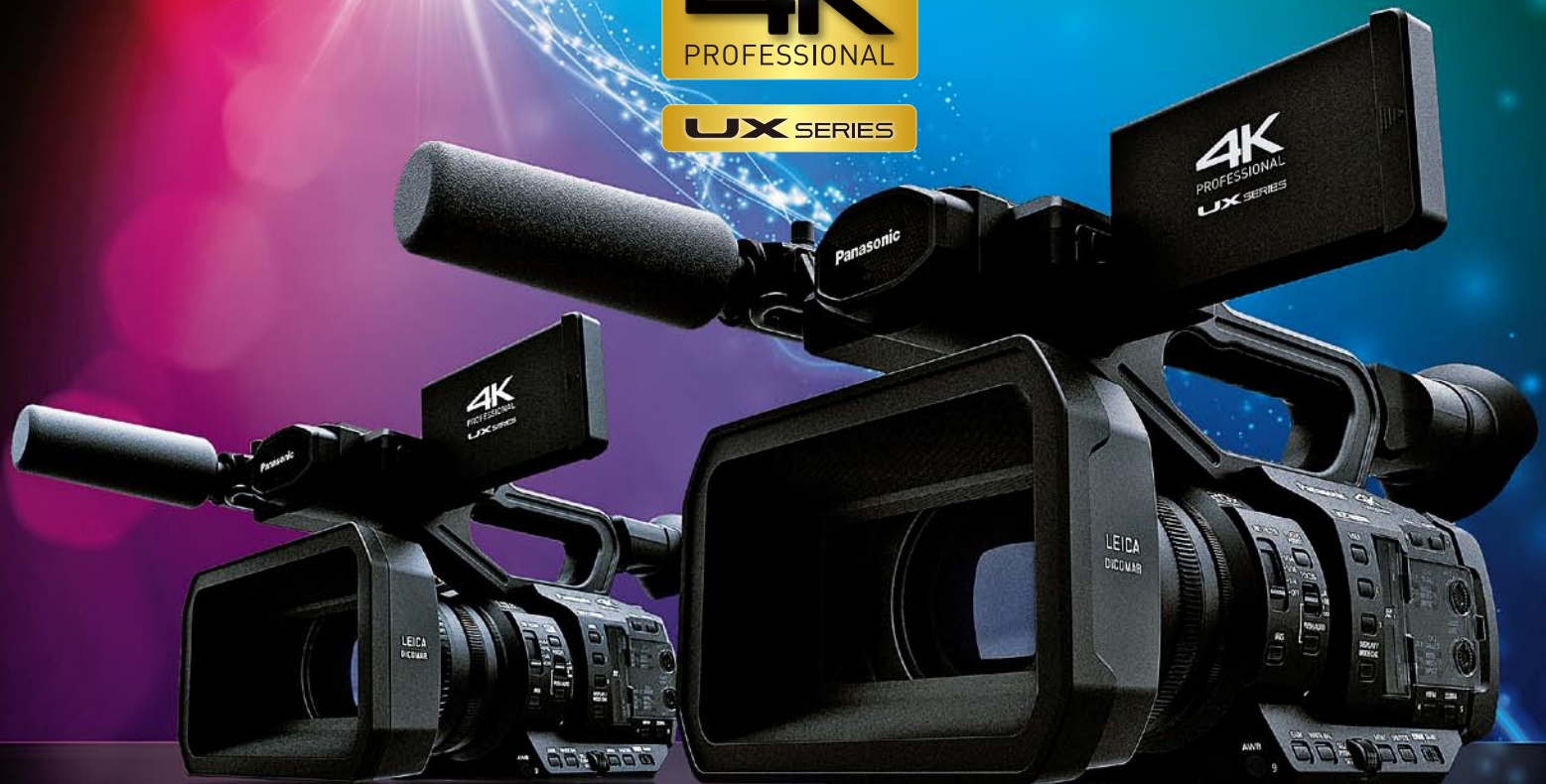
AG-UX90 UX Standard Model